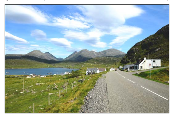
Visit www.cioch.co.uk for the newsletter online

was only time for a couple of badly needed pints before